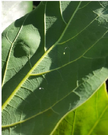
Green Lacewing Eggs

“Working with the Grower to Create Healthy Orchards”