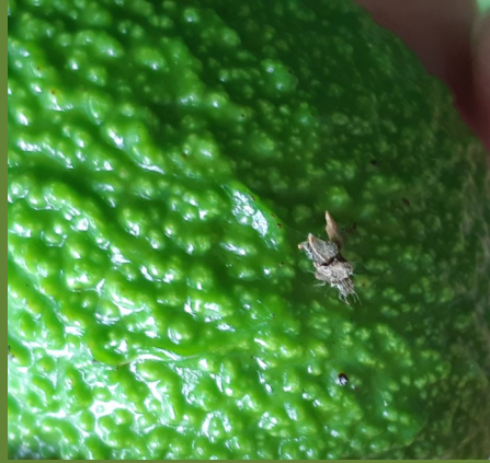
Photo: Green Lacewing Juvenile

“Working with the Grower to Create Healthy Orchards”