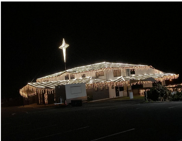
Changepoint Church in Poike Rd, Tauranga

“Working with the Grower to Create Healthy Orchards”