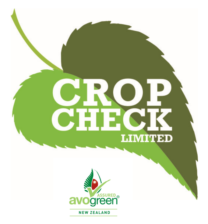
"Working with the Grower to Create Healthy Orchards"