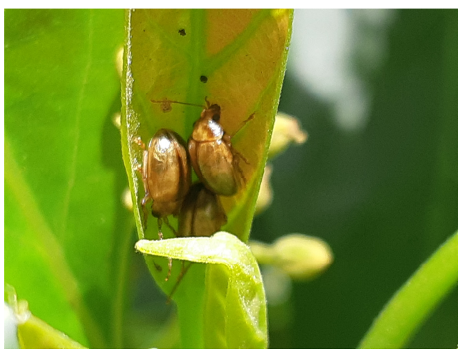
Bronze Grass Grub Beetle Costelytra zealandica