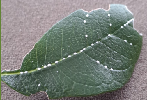
Photo: Chinese Wax Juvenile Scale