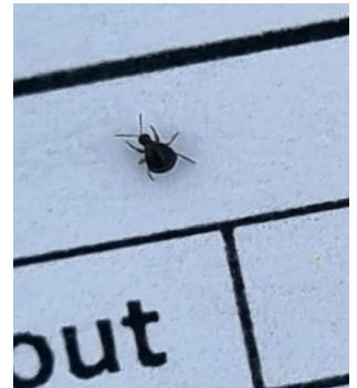
Photo: Oribatid Mite found on blueberries. They usually live in the soil.

If you know of anyone who could be suitable to help us with monitoring next season, please get them to contact the office. It is good to have staff based in Waikato, as it reduces the mileage costs for growers.