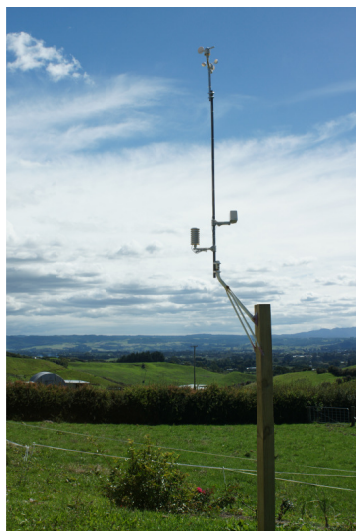
View from Crop- Check office.

See www.ohauti-weather.co.nz for local weather stations.